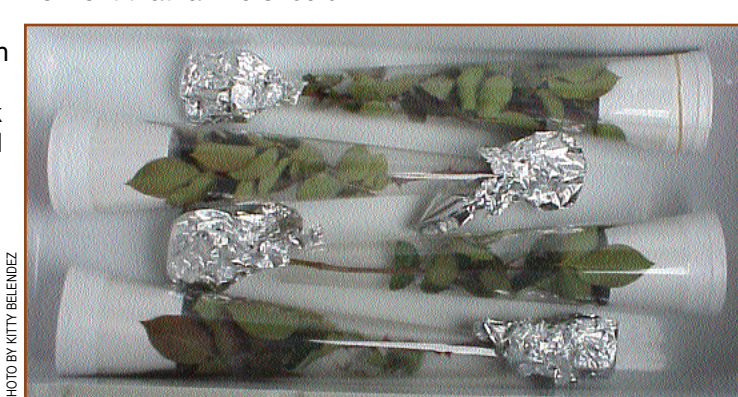
Rose Cones Lined Up Inside the Rubbermaid 80 Cooler.

That said, let's see if I can answer your questions. A. We purchased a huge box of the cups from Smart & Final. It's kind of like Costco, but a much smaller store, and they mostly handle only foods and food-related supplies. Some people call these cups "chili cups." The name and model number on the cup is: Handi-Kup