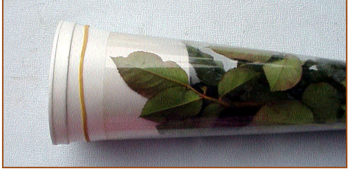
Rose inside of chile cup and rose cone.