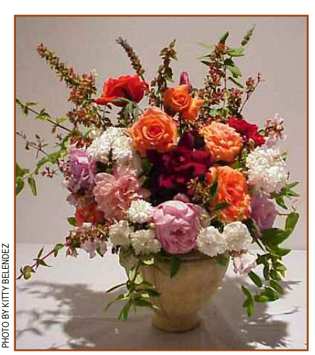
Large Traditional Arrangement Shown by Tee Bower at Los Angeles